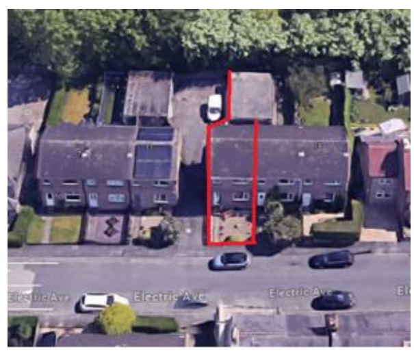
GOOGLE EARTH IMAGES OF 11 ELECTRIC AVENUE PROPERTY AND GARAGE LAYOUT